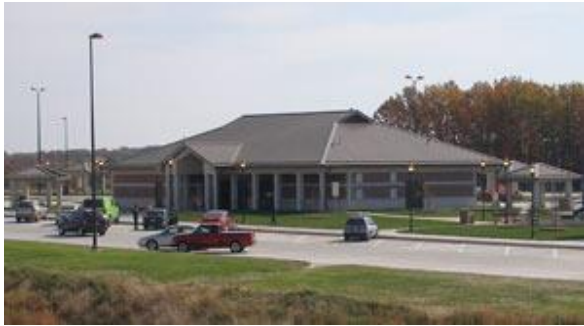
The Rock Port Welcome Center and Rest Area (which will be identical to the building shown here) is located on south bound Interstate 29 just south of Exit 110 in Atchison County, Missouri.

The mural must be durable, low maintenance, vandal resistant, and appropriate to the location. The artist should take into consideration the high amount of pedestrian traffic at the Welcome Center, light (both natural and electric), and temperature control when designing the artwork.