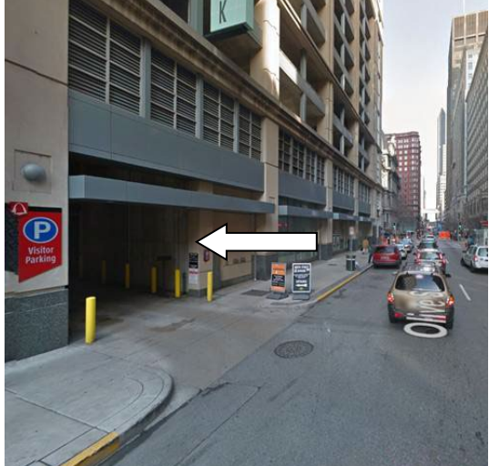
Entrance to garage on Olive.